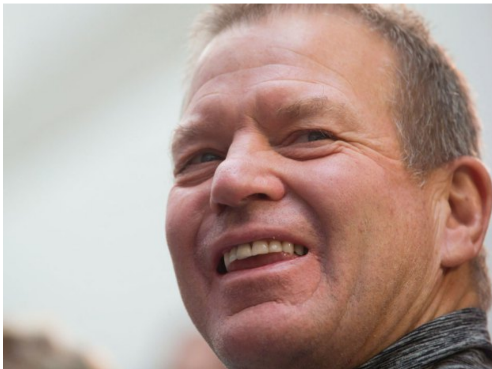
Lululemon founder and billionaire Chip Wilson.

A noticeable absence is Chip Wilson, who remains on Lululemon’s board. His wife says he is not involved in day-to-day operations, but is a mentor and guide.