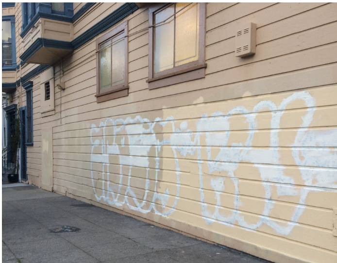
Envision murals in our neighborhood. Locations such as the one pictured above are great places for art in our neighborhood.

Can you create large-scale paintings? Do you know of any building owners that would be interested in creating landmarks with murals (with city approval, of course)? Let us know what you want to see and where you want to see it.