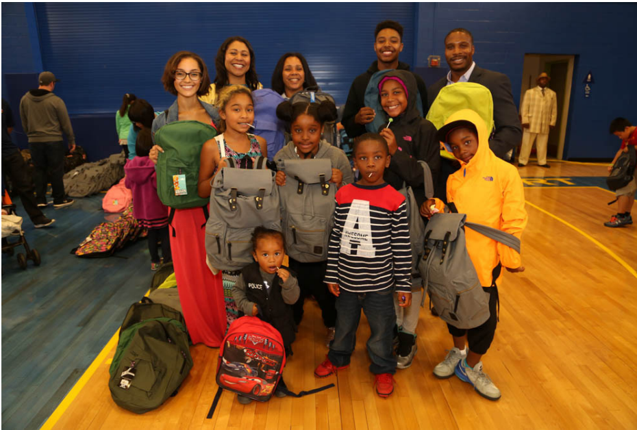
District Supervisor, London Breed, with community members attending the annual Backpack Giveaway & Health Fair in 2015.

This August, Collective Impact will be mounting our annual Back to School Celebrations at the Ella Hill Hutch Community Center (1050 McAllister Street, between Webster & Buchanan Streets). These yearly events are much anticipated throughout the Western Addition community, and offer a safe, fun, and spirited coming-together for residents.