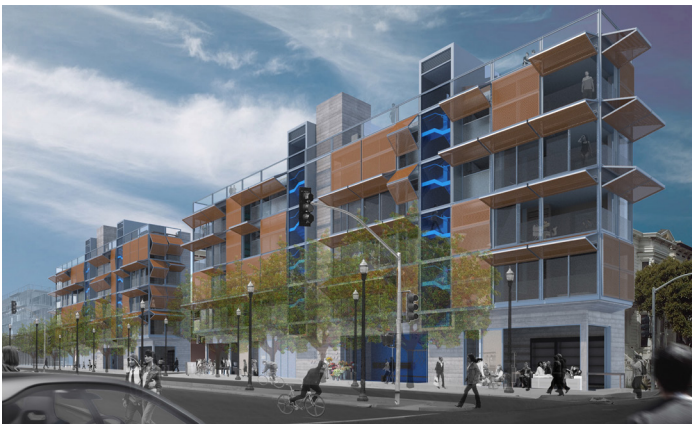
Concept art for the new mixed-use structures to be built on parcels M & N along the east side of Octavia, between Fell and Oak.

Set along the east edge of Octavia Boulevard, parcels M and N are among the most challenging of the former freeway sites. The two 120-foot-wide parcels are just 18 feet deep, defying typical housing configurations. Instead, the design uses the site's shallow footprint to encourage a lifestyle that is engaged with the existing community.