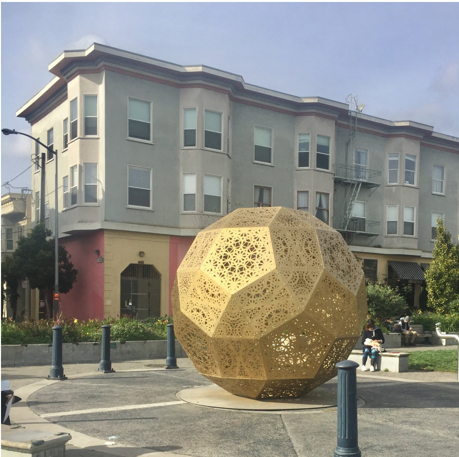
Currently on display: Large sculpture by HYBYCOZO in the center of Patricia's Green, made from laser-cut steel and assembled on-site. (Photo by Russell Esmus).

Two new sculptures bring new sense of wonder to Hayes Valley!