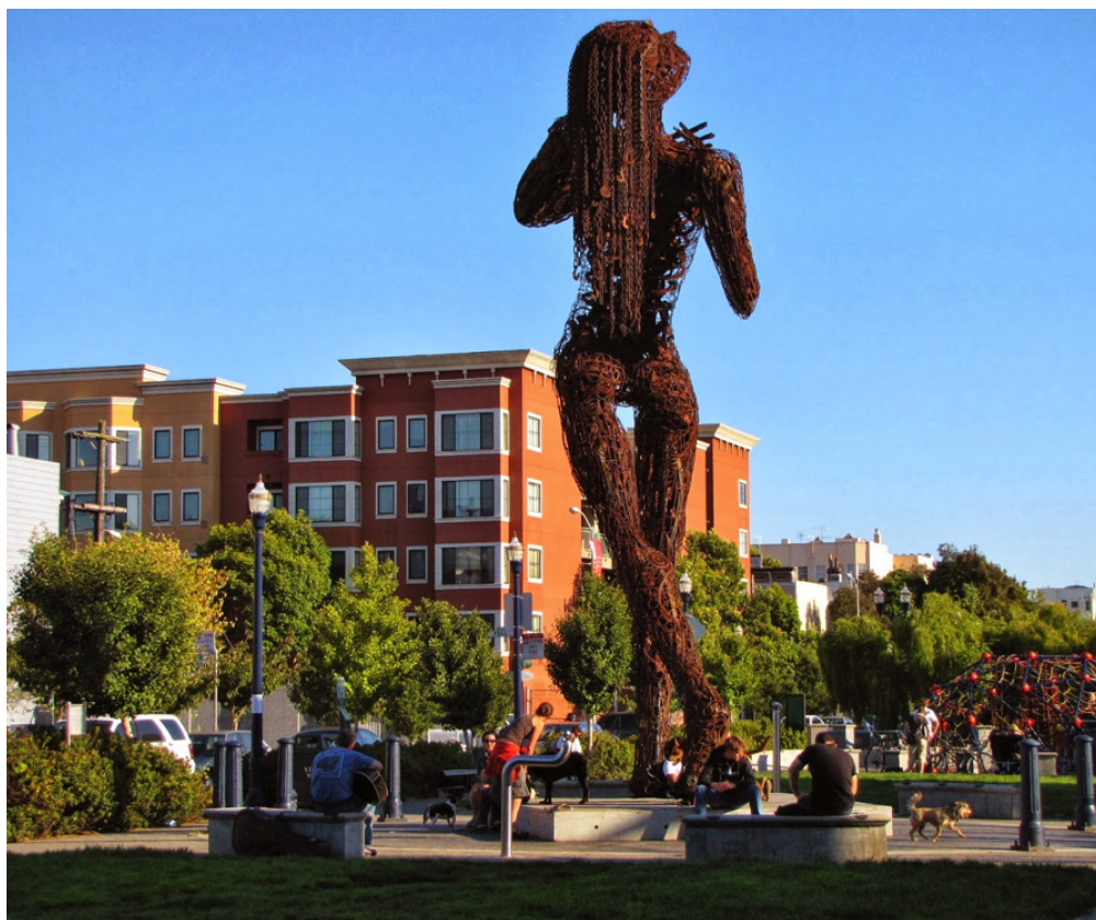
The ginkgo trees at Patricia's Green c.2010 (with temporary sculpture "Ecstasy")