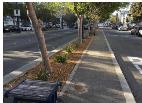
Octavia Boulevard restored.

I t's almost Summer and you can see the impact neighbors in Hayes Valley can have together. Working with neighborhood groups, Public Works and The Mayor's Office, the HVNA "Greening" Committee is focused on supporting the creation of Living Alleys (Lily, Linden etc.); Sidewalk Greening (see photo) in conjunction with The Friends of the Urban Forest (FUF); the restoration of key Hayes Valley thoroughfares (see photo of Octavia Blvd.) and to a more permanent solution to our unsightly trash situation...keeping our streets clean and green!