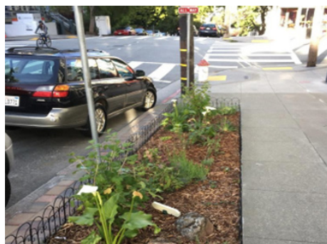
Working with FUF property owners can have Sidewalk Gardens as a fixture in front of their property. Hayes & Laguna there is real pride of garden going on!

What was once a Freeway is now, once again, a beautiful thoroughfare in the heart of Hayes Valley. Gone are the waist high weeds, needles and trash. The trees are trimmed, irrigation renewed, and new plants and mulch placed. Now, when you walk Octavia Blvd and you see trash on the street...pick it up...so we can keep it fresh on Octavia. All of us can be a part of greening our neighborhood. green@hayesvalleysf.org