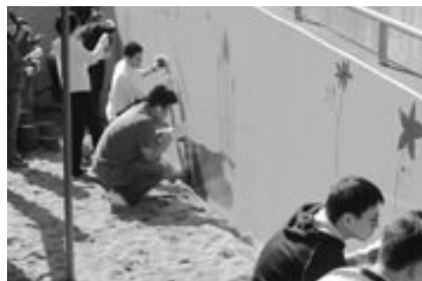
Volunteers paint a new mural during the cleanup at the Hayes Valley Playground

05.26, Thursday 7-8:30 pm H.V.N.A. General Meeting 7 Octavia (at Waller) Contact info: www.hayesvalleysf.org