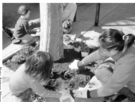
Planting seeds for the coming school year - families of the newly merged Rosa Parks Elementary School and JBBP gathered for a day of campus gardening in March. JBBP is currently accepting students in grades K through 5 for the 2006-2007 academic year.