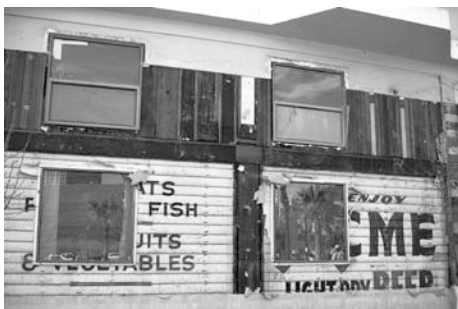
A little local history was revealed during recent renovations of the Cafe Grillades on Hayes Green