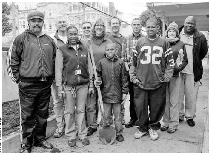
Some of the many Hayes Valley Neighborhood Parks Group Stakeholders at a recent work day.

The HVNPG has created an oasis of beauty and community stewardship in San Francisco that is second to none. Please join us in honoring them! If you would like to attend the luncheon, get involved in the parks or make a donation, please contact: hvnparks@hotmail.com. The Tides Center (Fed ID# 94-3213100) is the fiscal sponsor of the HVNPG.