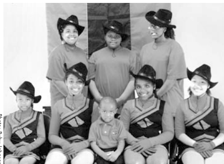
SF Western Addition Drill Team at a recent performance

■ The San Francisco Western Addition Drill Team will perform in a live Gospel video performance, "The Crave to Praise" on Saturday, November 18th at 7:30pm. The performance will be at the Berkeley Community Theatre, Allston and MLK Way, in Berkeley.