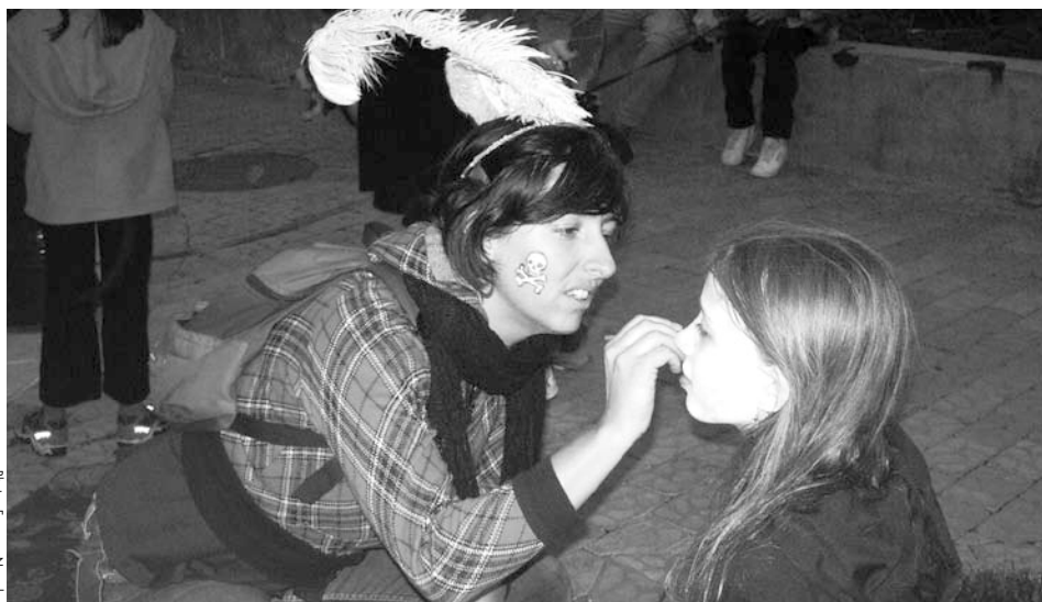
Happy participants in the Hayes Valley Community Partners Halloween Festivities at Patricia's Green. See article on Page 4 for a description of upcoming events.

Let's all get out, have a good time, and support our merchants!