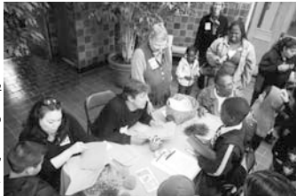
PTA members and kids at John Muir Elementary are excited at the first day of school last year