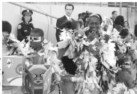
Police Chief Heather Fong and Mayor Newsom look on as our amazing neighborhood youth perform during National Night Out at Hayes Valley Playground.

Sponsored by Community Partners United*, a collaboration of neighborhood groups, and in conjunction with our local SFPD at Northern Station, the event was part of a National Program where neighborhoods come out and occupy their parks and open space with positive programs and support for our families, youth and seniors. The essence of National Night Out: Heighten crime and drug prevention awareness; Generate support for, and participation in, local anticrime programs; Strengthen neighborhood spirit and police-community partnerships; and Send a message to criminals letting them know that neighborhoods are organized and fighting back. This year included a resource fair, where community groups and agencies could reach out and provide critical information to residents.