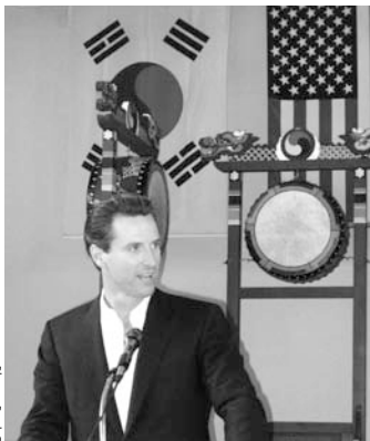
Mayor Newsom addressing the community at the Korean American Cultural Center on November 3.