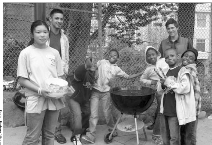
Neighbors and volunteers gather round the BBQ after an early November work day and Harvest Festival at Koshland Park