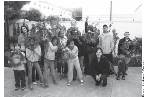
Wreath Making Results