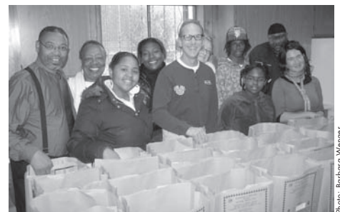
Preparing Food Bags