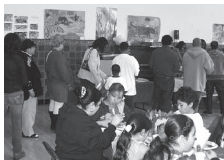
Thanksgiving Dinner at John Muir Elementary