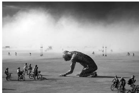
The crouching figure of Koilos in the desert at Burning Man 2007

They have met with their next artist, Mark Baugh-Sasaki, who will be creating a site-specific sculpture. A plan is emerging to use the trunks of fallen Golden Gate Park trees –