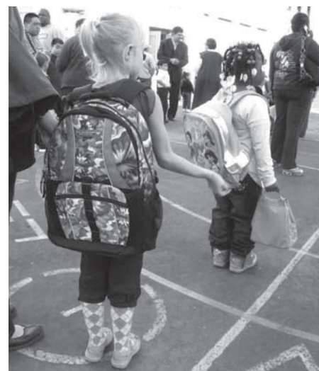
The first day of school!

The school year has begun, and we have such good news for our community! The number of families enrolling at John Muir ES has increased quite a bit. We even have a waiting list this year for some grades. Our test scores are beginning to show improvement. And, most important to our children, new playground equipment will be installed by the end of the year!