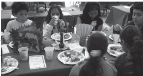
Season of Caring Thanksgiving 2007