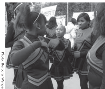
Western Addition Drill Team at this year's National Night Out

October 23: Plan Halloween activities for all to participate in and the kick-off of the 2008 Season of Sharing. Come together as neighbors to plan events for all the community.