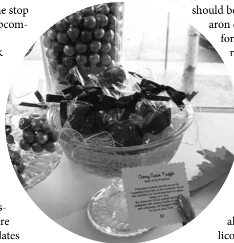
Truffles at Miette

The other location is in Beverly Hills. Hayes Valley and Beverly Hills is a good duo. These traditional French cookies are made by hand and all have natural flavors and colors. This store has been in business for 10 months and also carries a line of coffee and teas. They specialize in the hard to find Mariage Freres tea. This tea has been around since 1854 and comes in many flavors. The holidays should be good for Paulette Macaron especially as party favors for the fun times over the next few months.