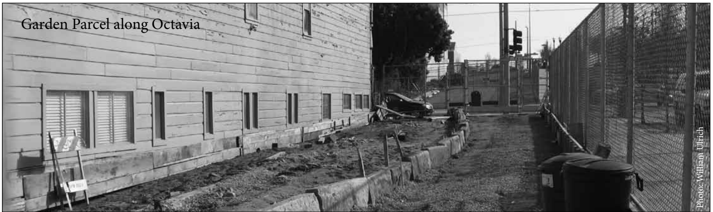
Garden Parcel along Octavia

Please come, and participate. You don't have to be a member of HVNA to participate in our meetings, although membership dues support our activities and many neighborhood projects. (You must be a member of HVNA to vote in the upcoming Board election.)