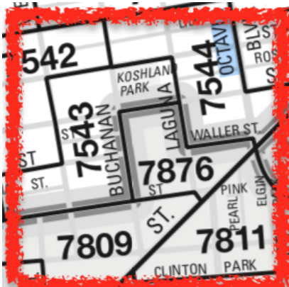
Figure 2A: Existing D5 Closeup around 55 Laguna area